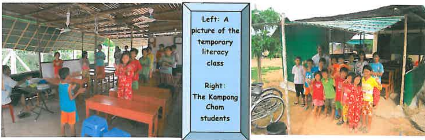
Left: A picture of the temporary literacy class

We used your donation to buy materials to build the classroom and supplies such as ceiling fans, whiteboards, and stationery supplies. Because the classroom is a bit further for two students (sisters) we helped to buy a bicycle for them to bike to school and to worship on Sunday. We also bought some stationery supplies for the literacy class in Chihae as well. The children love to draw and color. They all were very appreciative.